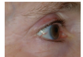
3 months after treatments